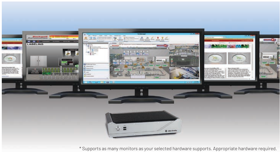
Up to 7 monitors are supported by the VersaView 5200 Multi 4K display from Allen-Bradley pictured above.

Drive multiple* 4K monitors from a single thin client. Assign multiple applications and screen configurations to every monitor to ensure everything in your plant stays in view.