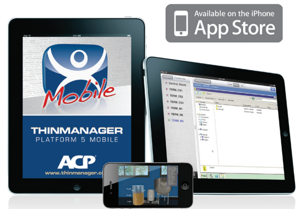
Fig.1 Screenshots from iPad.

The new ThinManager app is available today at the Online App Store from Apple®.